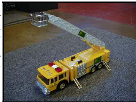
Exhibit Committee Designs Belmont Firehouse Future!

A small committee has been meeting for the last couple months to help develop the designs and eventual exhibits that will grace the Belmont Firehouse in the near future.